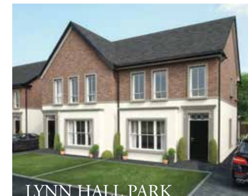
LYNN HALL PARK Bangor