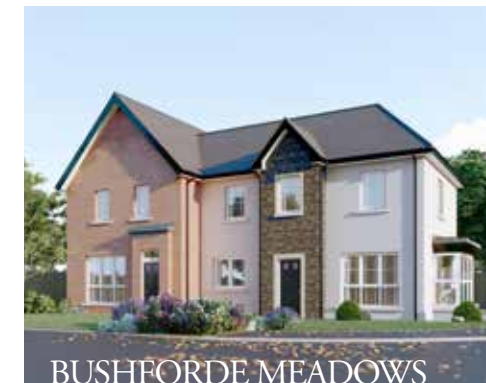
BUSHFORDE MEADOWS Antrim