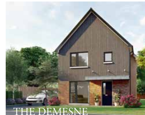
THE DEMESNE Woodbrook, Lisburn