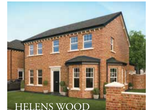
HELENS WOOD Bangor