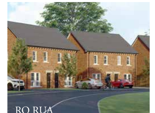
RO RUA Toomebridge

Built in the right place, in the right way, in the right style, by the right people.