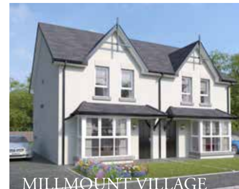
MILLMOUNT VILLAGE Dundonald