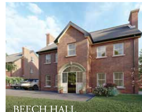
BEECH HALL Magheralin