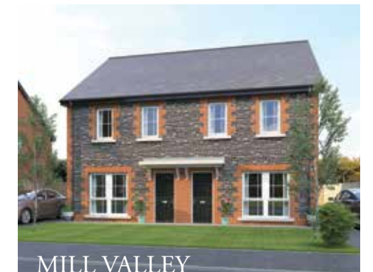
MILL VALLEY Belfast