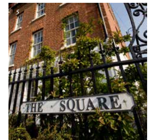
1_ Walk leading down to Lady Alice Temple in the grounds of Hillsborough Castle, 2_ Hillsborough Castle, 3_ Irish Linen Centre & Lisburn Museum, 4_ Lagan Tow Path 5_ The Square, Hillsborough